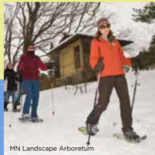
MN Landscape Arboretum